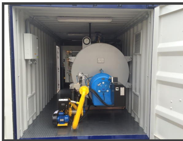
Easy Access for Operation and Maintenance